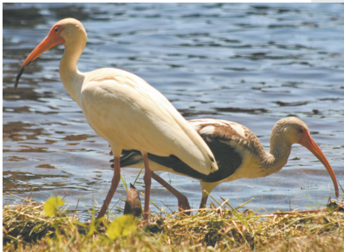
Top: Two White Ibis (juvenile on right) pick through beach debris. Bottom: A Loon swims peacefully at the East Pass to the Suwannee River.

For experienced saltwater paddlers, primitive campers and adventurers, this pristine 105-mile trail from the Aucilla River to the Suwannee River, offers one of the most unique experiences in bird watching on the Hidden Coast. For less experienced paddlers, parts of the trail are accessible for day paddling. The trail is closed July 1-August 31. For more information including ordering a 40-page guide and reserving campsites, go online to www.myfwc.com/RECREATION/WMASites_BigBend_paddling_trail.htm .